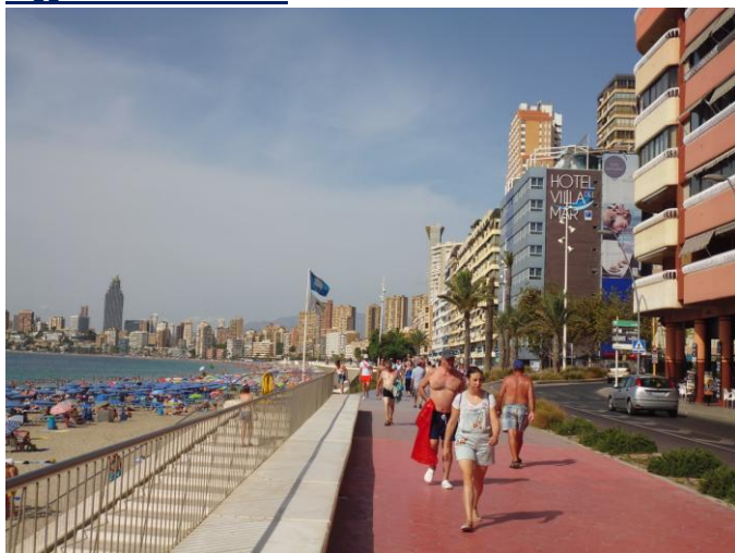
Hotel “ Magic Villa del Mar**** ”

The 4 Stars (****) Hotel “ Magic Villa del Mar ” will be the main official hotel and is located in the “Poniente” beach of Benidorm, at Avenida Armada Española, 1, 03500 Benidorm, Alicante .