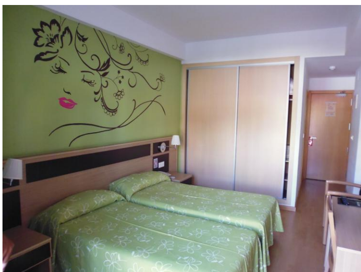
Room at “ Hotel Golden ”

Complementary Hotels are “Golden” and “Marconi”, both located around 80 metres from “Magic Villa del Mar”, are also in the Poniente Beach.