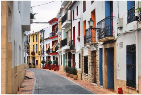
Street in La Nucía

La Nucía is located in a fruit valley between Benidorm and Callosa d'En Sarrià, 3 km from the coast of Altea. The urban center is on a promontory overlooking the Mediterranean Sea, 51 km north of Alicante Airport and 8 km north of Benidorm. Population (with over 80 different nationalities, mainly europeans) are 17.000 citizens.