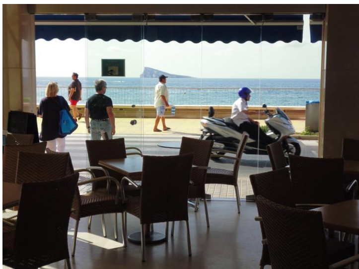
View from “ Marconi ” Hotel.

The three official Hotels, “ Marconi ”, “ Golden ” and “ Magic Villa del Mar ”, are located in the main commercial street of Benidorm, in a safety and fun touristical area of Benidorm city, not more than 8 km from venue site in La Nucia.